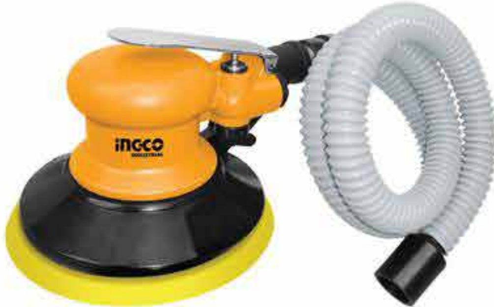
APS1501 INDUSTRIAL 6" Air sander