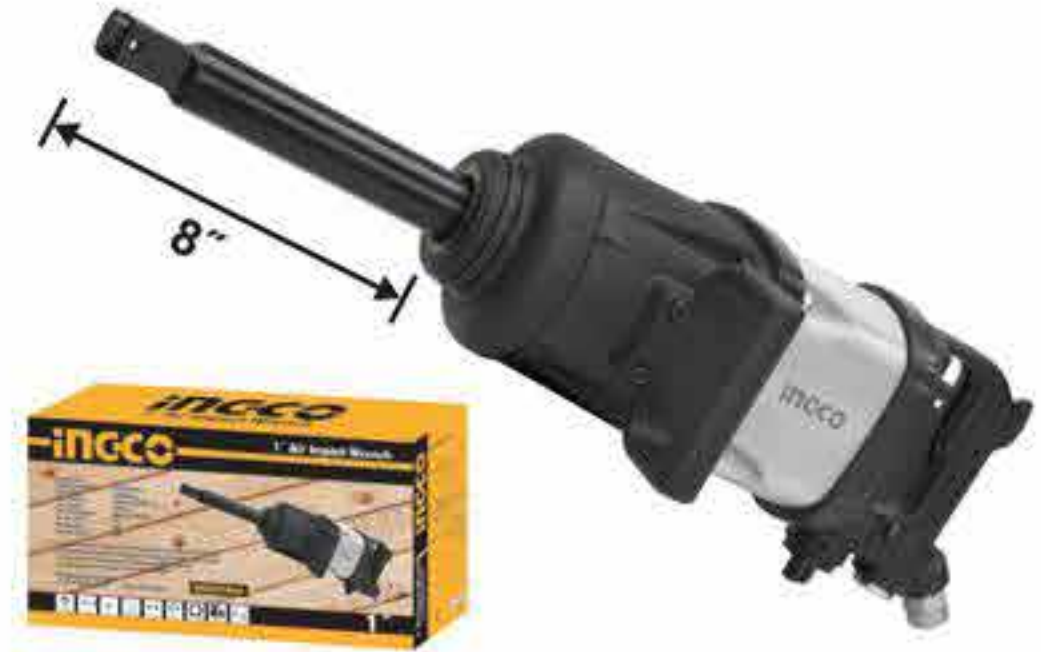
AIW11222 INDUSTRIAL 1" Air impact wrench