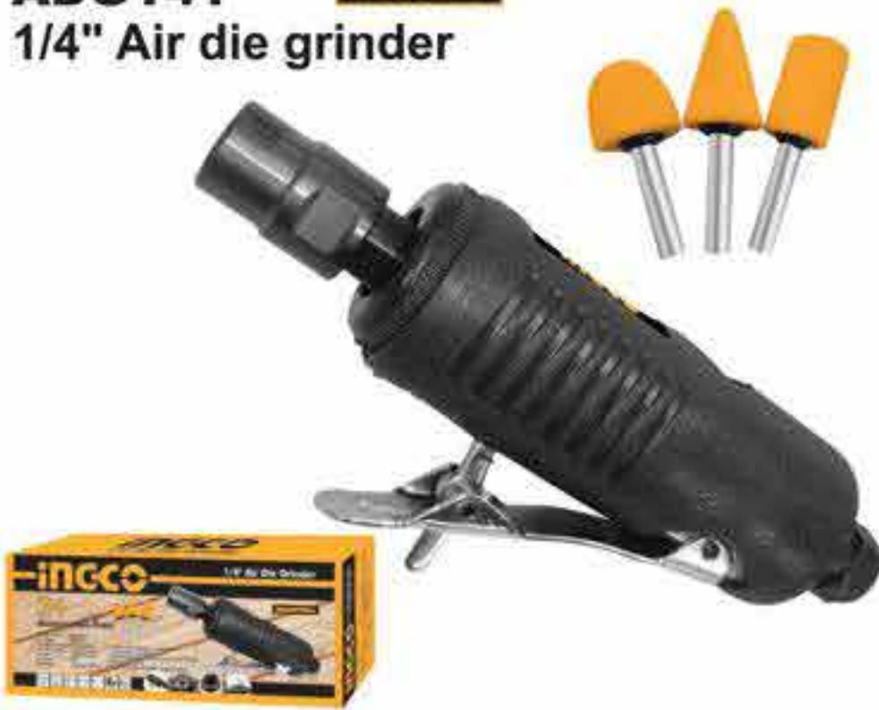
ADG141 INDUSTRIAL 1/4" Air die grinder