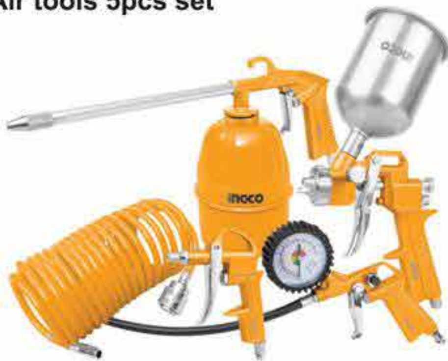
AKT0052 Air tools 5pcs set