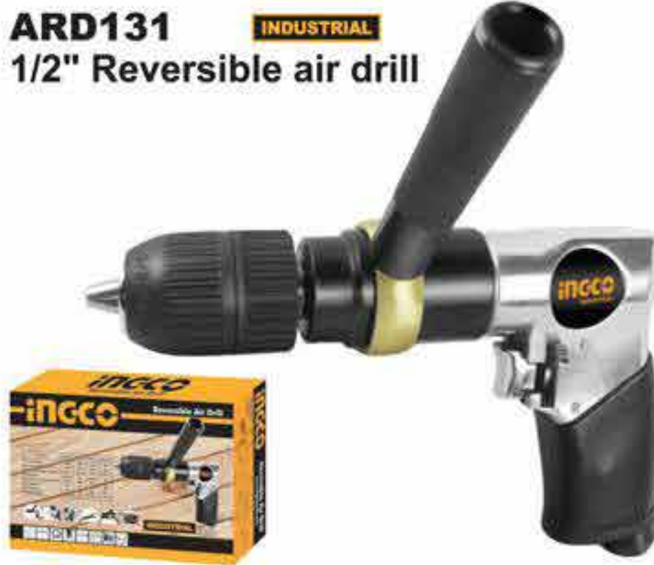
ARD131 INDUSTRIAL 1/2" Reversible air drill