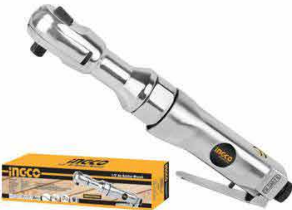
ARW121 INDUSTRIAL 1/2" Air ratchet wrench