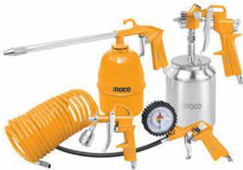
AKT0051 Air tools 5pcs set