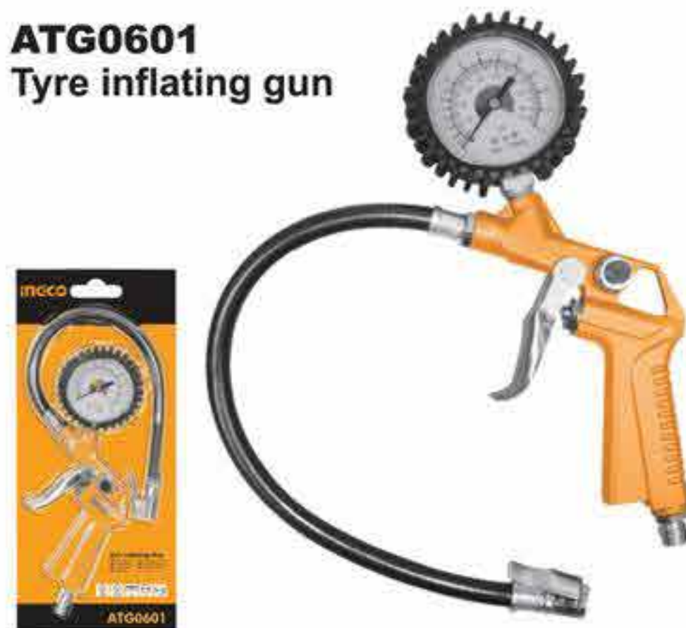
ATG0601 Tyre inflating gun