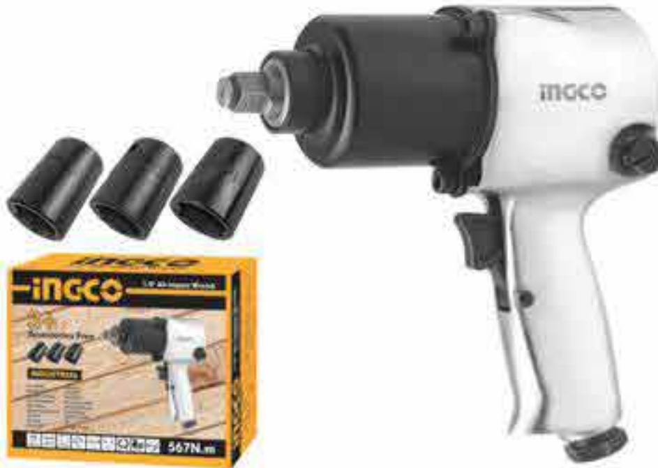
AIW12561 INDUSTRIAL 1/2" Air impact wrench