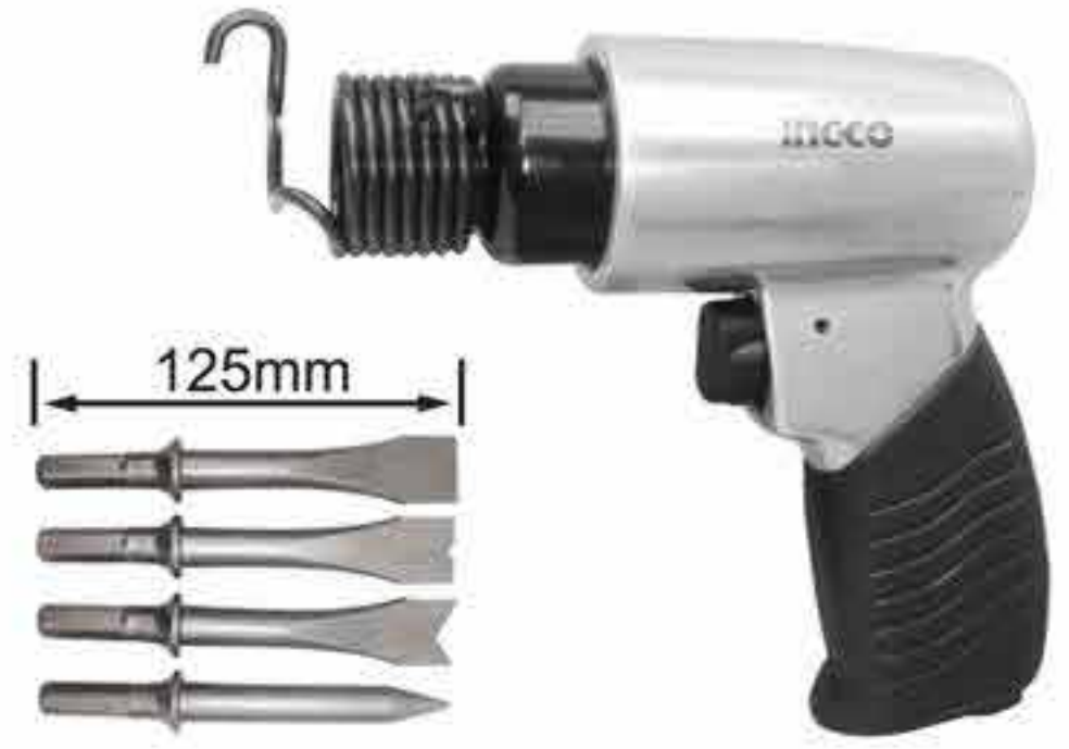
ARH102 INDUSTRIAL Air hammer