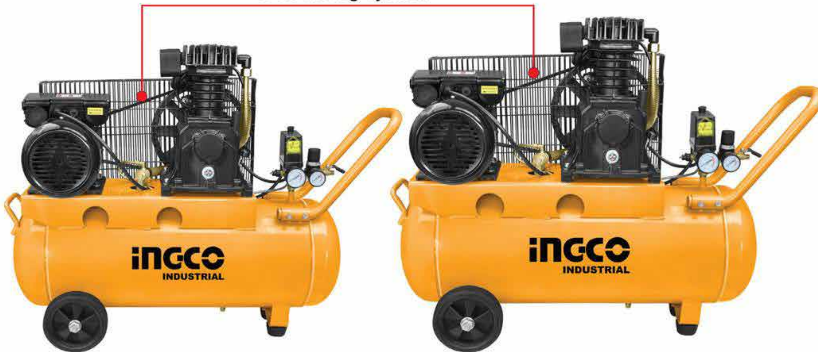
Belt driving system