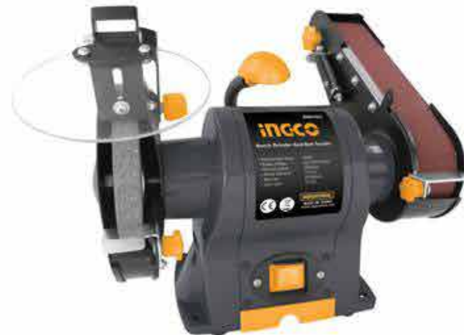
BGB63501 INDUSTRIAL Bench grinder and belt sander