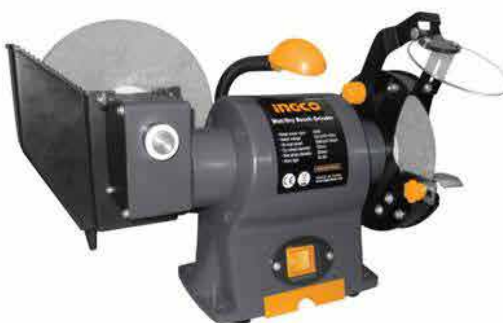
BG683501 INDUSTRIAL Wet/Dry bench grinder