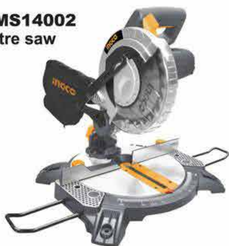
BMS14002 Mitre saw