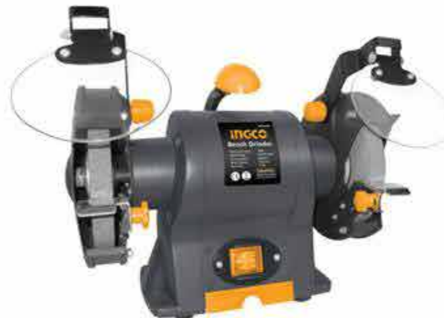
BGL63501 INDUSTRIAL Bench grinder