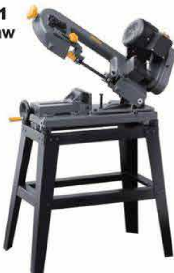
MS4001 Metal saw INDUSTRIAL