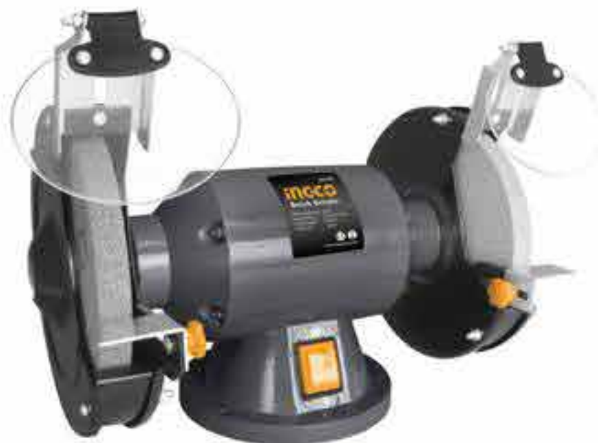
BG83502 Bench grinder