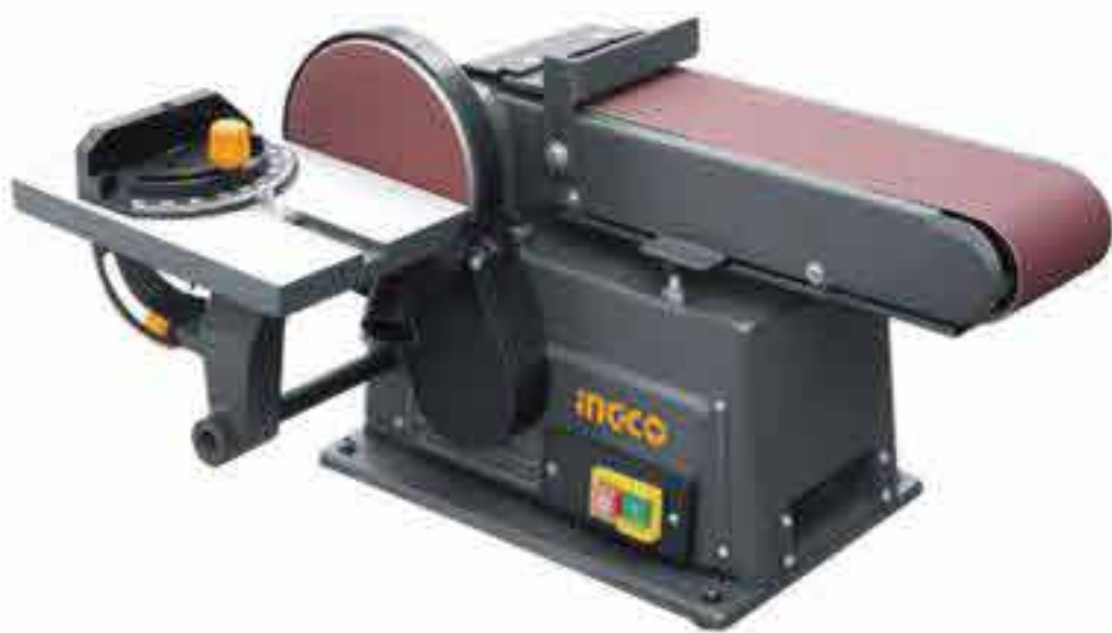
BDS5001 Belt and disc sander INDUSTRIAL