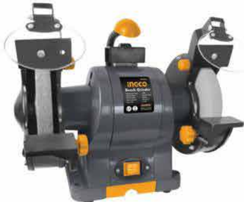
BGL85201 INDUSTRIAL Bench grinder