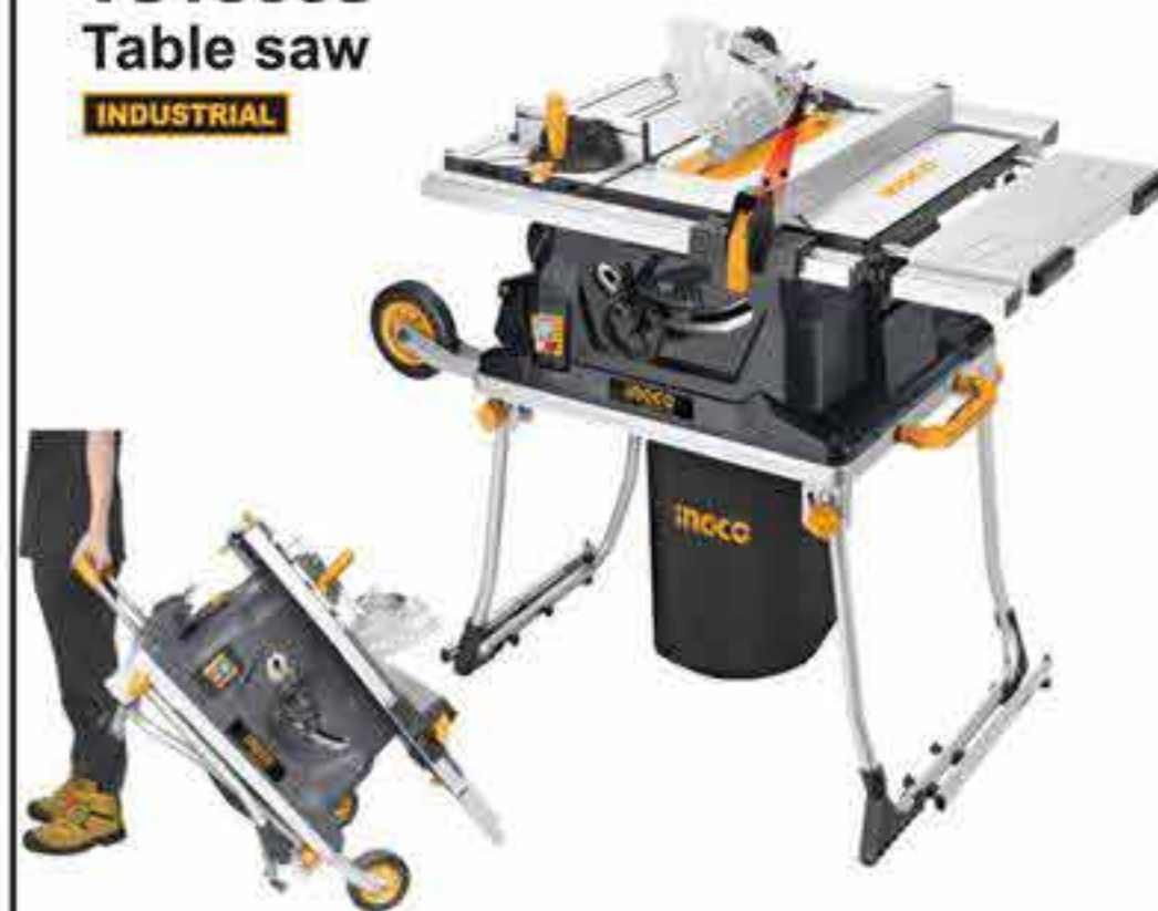
TS15008 Table saw INDUSTRIAL